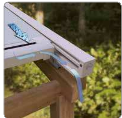
Mechanical safety for the bottom rail