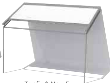
Topfix® Max F