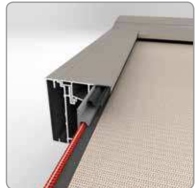
Side channel: Fixscreen® technology