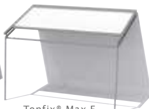
Topfix® Max F